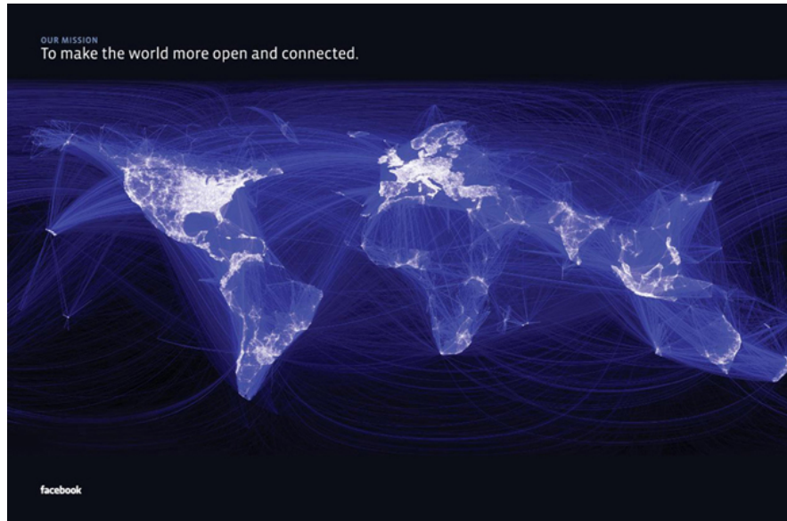
Figure 1: The World, as Viewed Through Facebook 23

Figure 1 shows that political boundaries are in a sense reinscribed even by human relationships mapped through Facebook. China is conspicuously absent because it censors Facebook. 24 Brazil, Japan, and Russia are not well represented because other social networks dominate there. 25