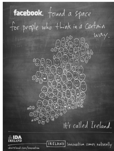
Figure 3: Facebook Advertisement 169